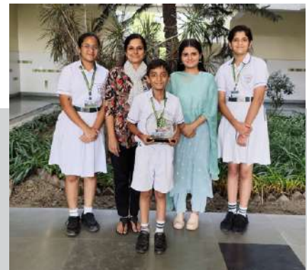
Inter DPS National Environment Festival-El Entorno