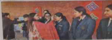
विद्यार्थियों को तिलक लगा कर उनके स्वर्णिम भविष्य की कामना करते हुए प्रस्तावनाओं के तहत कॉलेज में आयोजित।

चिंतन की कामना की गई। विद्यालय की काउंसिलर ने विद्यार्थियों को संबोधित करते हुए इस महत्वपूर्ण शैक्षणिक चरण में सकारात्मक बुद्धिकोण अपनाने, एकता, आत्मविश्वासी और आशावादी रहने के लिए प्रेरित किया। उपस्थित प्रमुख शिक्षक, कॉलेज के विद्यार्थियों को आशीर्वाद देते हुए उनके उत्कृष्ट प्रतिभा, उच्च स्तर का ज्ञान और सार्वजनिक जीवन की कामना की। कार्यक्रम का समापन प्रेरणादायक वाक्यों के साथ हुआ, जिससे विद्यार्थी आगामी चुनौतियों का सामना दृढ़ संकल्प और विश्वास के साथ करने के लिए प्रेरित हुए।